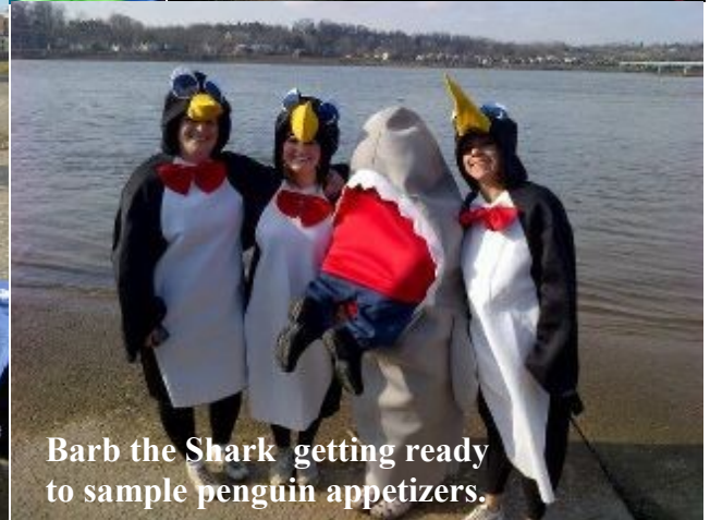
Barb the Shark getting ready to sample penguin appetizers.